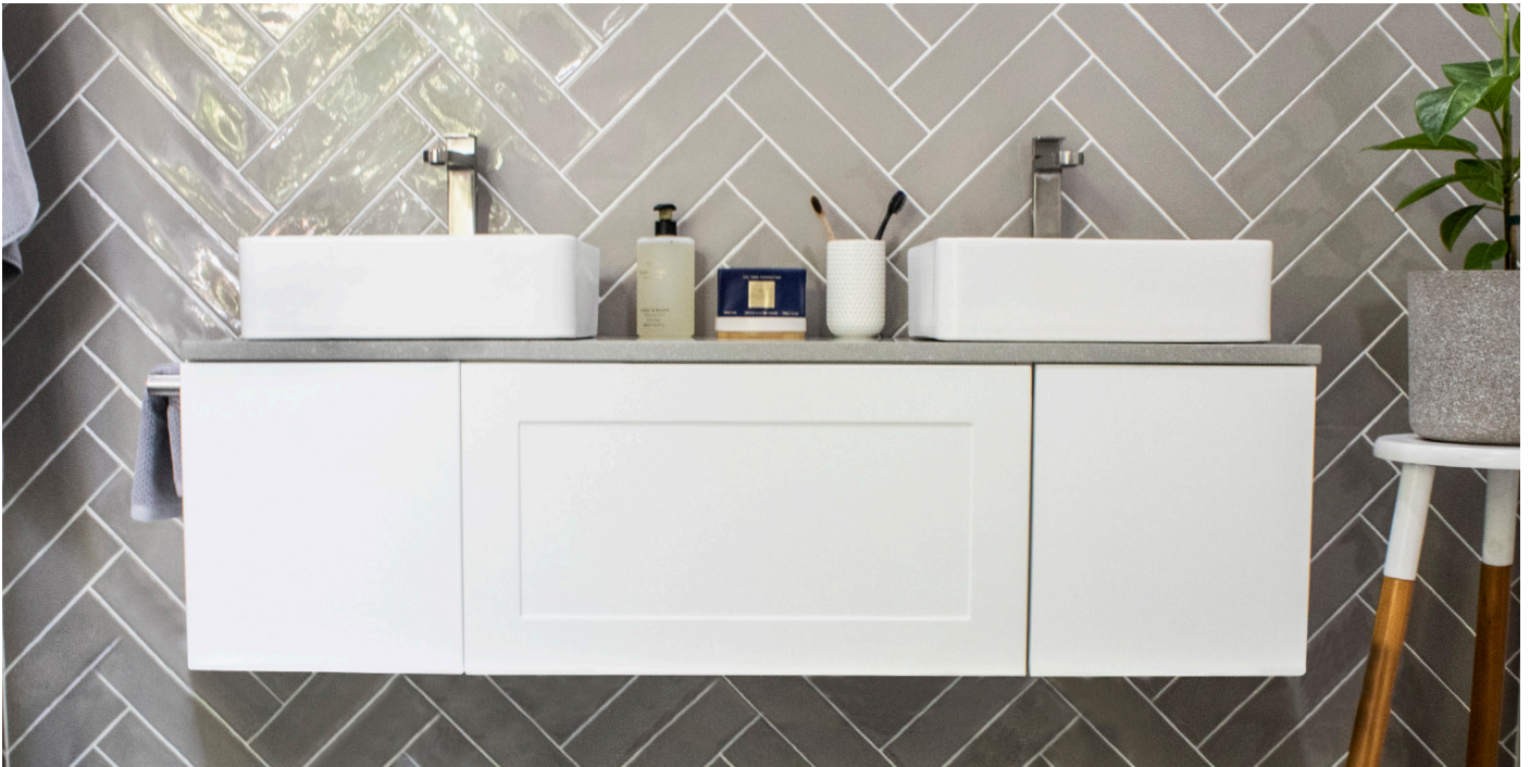
Pictured: BOSTON Drawers and Wall Hung Vanity 600mm (Centre) with 2x EDEN Drawers and Wall Hung Vanities in 300mm size (Left and Right).