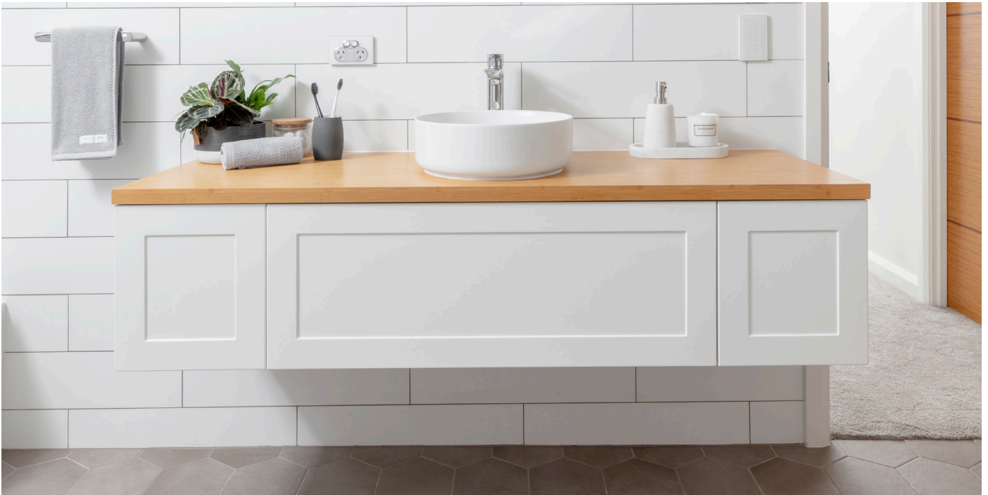
Pictured: BOSTON Wall Hung Vanity 900mm (Centre) with 2x BOSTON Wall Hung Vanities in 300mm size.