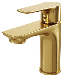
Brushed Brass ED100-BB