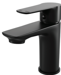
Matte Black ED100-MB