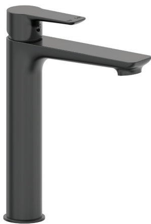
Matte Black ED110-MB