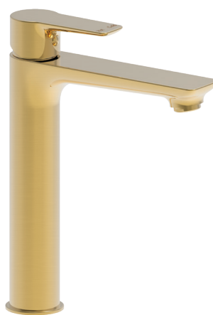
Brushed Brass ED110-BB