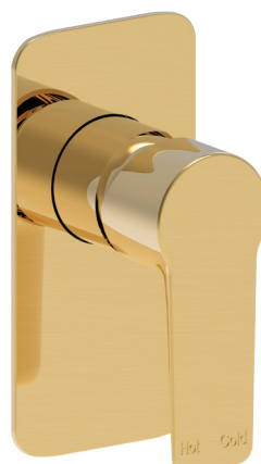
Brushed Brass ED141-BB