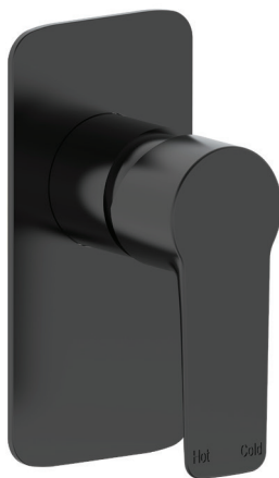
Matte Black ED141-MB