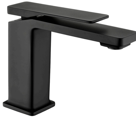
Matte Black EV100-MB