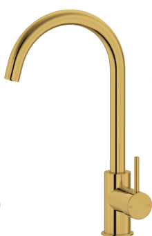
Brushed Brass SP120-BB