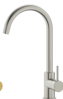
Brushed Nickel SP120-BN