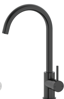
Matte Black SP120-MB