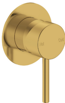
Brushed Brass SP141-BB