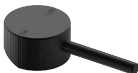
Matte Black MPH-MB