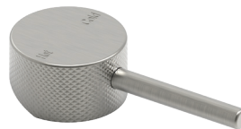
Brushed Nickel MPH-BN