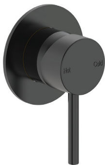
Matte Black SP141-MB