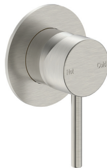
Brushed Nickel SP141-BN