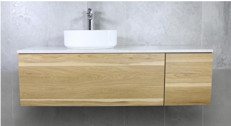
1x VED900T Modular Vanity and 1x VED300T cabinet to create a 1200mm cabinet