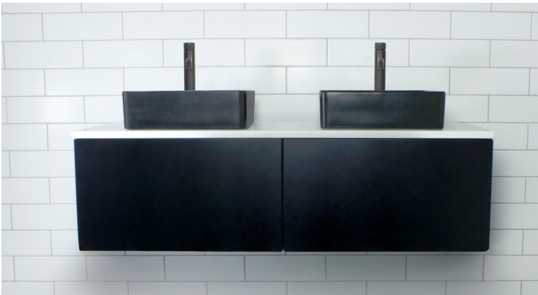
2x VED600M Modular Vanities to create an 1200mm cabinet