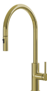
Champagne Gold ZA121-CG