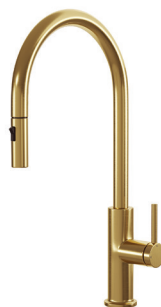
Brushed Brass ZA121-BB