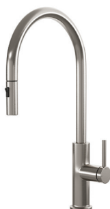
Brushed Nickel ZA121-BN