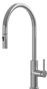
Polished Stainless Steel ZA121-PS

CONGRATULATIONS ON THE PURCHASE OF YOUR NEW CASA LUSO TAPWARE, WE HOPE YOU AND YOUR FAMILY ENJOY YOUR NEW PRODUCT AND CONSIDER US FOR ANY FUTURE PROJECT. CASA LUSO PRODUCTS HAVE BEEN MANUFACTURED UNDER THE HIGHEST STANDARDS OF QUALITY AND WORKMANSHIP