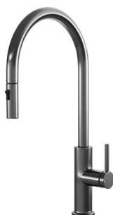
Gun Metal ZA121-GM