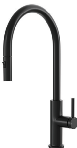
Matte Black ZA121-MB